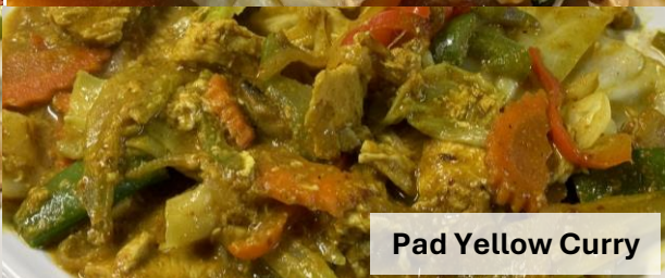
Pad Yellow Curry