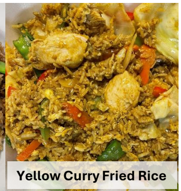
Yellow Curry Fried Rice