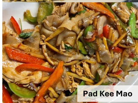
Pad Kee Mao