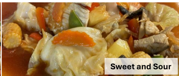
Sweet and Sour