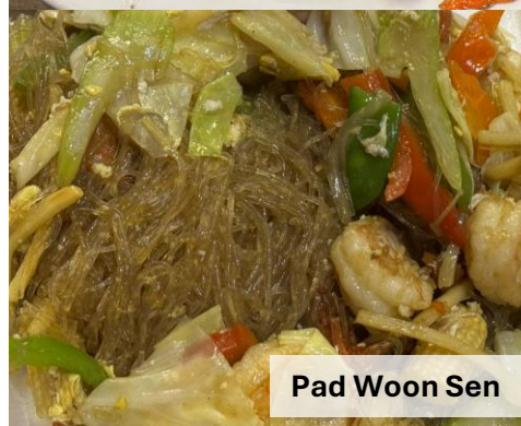
Pad Woon Sen