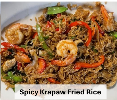
Spicy Krapaw Fried Rice