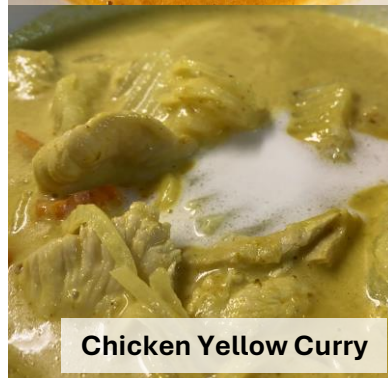
Chicken Yellow Curry

All curries come with a side of white rice