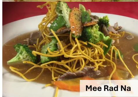
Mee Rad Na