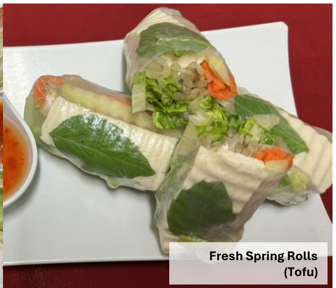
Fresh Spring Rolls (Tofu)