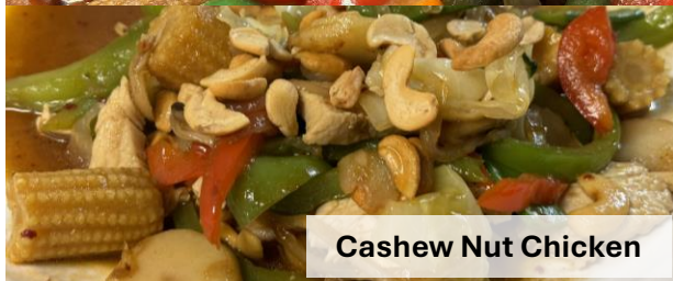
Cashew Nut Chicken