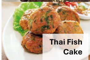
Thai Fish Cake